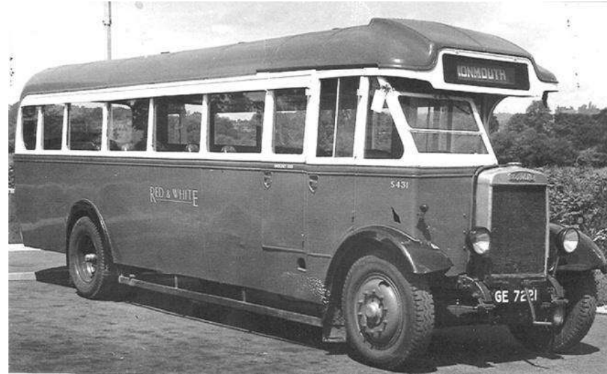
Another view of GE 7221 after repainting and with the new 1951 fleet number S431.