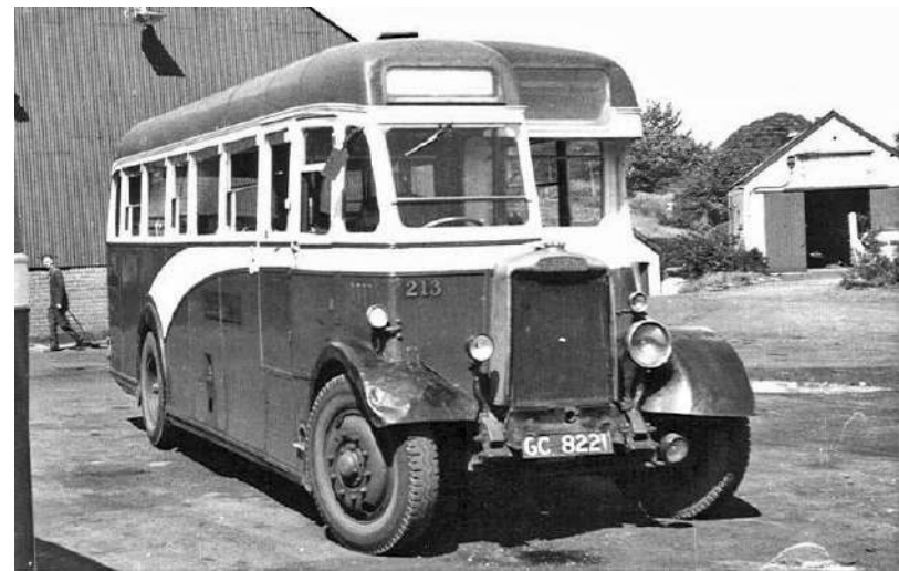
GC 8221 (213) rebodied by Duple and photographed after transfer to United Welsh.