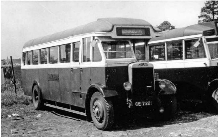
GE 7221 was originally a Leyland Titan TD1 double decker, parts of which were used to rebuild a Leyland Tiger chassis in 1943. It was fitted with a second hand 1932 E.C.O.C. C32R body taken from a North Western Road Car Leyland Tiger TS4 chassis. Starkey of Ton Pentre, Rhondda refurbished the body which was fitted with bus seats. This photograph was taken c1950. (Alan B Cross)