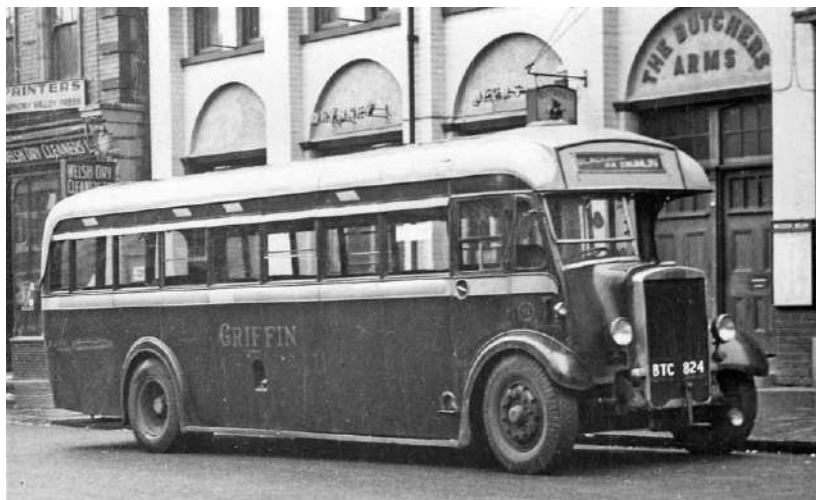
1937 Leyland Tiger TS7 BTC 824 with Leyland B32F bodywork (later Red & White 597 and S2337) in original Griffin livery of dark red and grey outside the Butchers Arms in Blackwood.