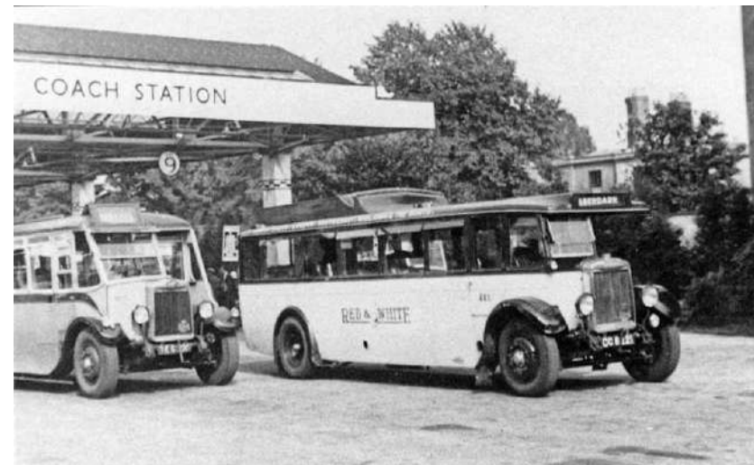
ex-Great Western Express 1930 Leyland Tiger GC 8221 (213) in early 1930s Red & White livery at Cheltenham Coach Station.