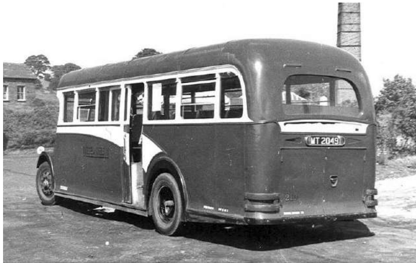
A view of the above Leyland Tiger MT 2049 (210) as rebodied by Duple and after transfer to United Welsh.