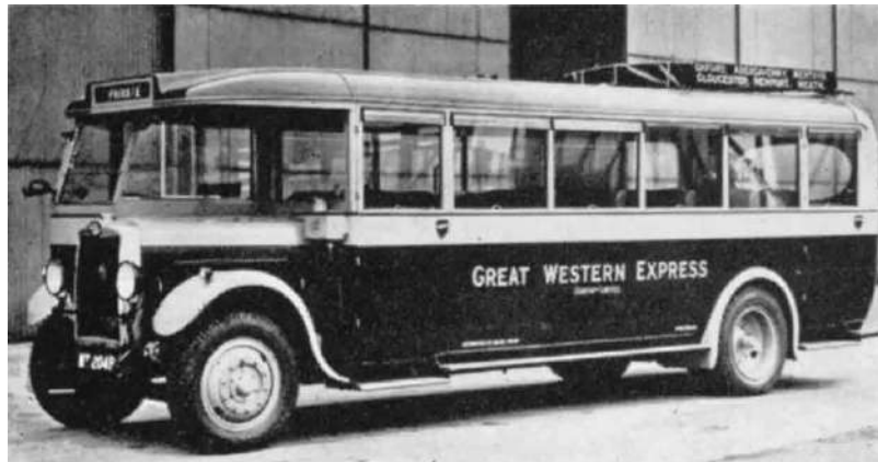
1929 Leyland Tiger MT 2049 in Great Western Express livery with Dodson C22D bodywork. This vehicle lost its body in a fire when 6 months old and was rebodied with another Dodson body

# The 1948 Duple C35F body on BDW 6 was transferred to Leyland Tiger PS1/1 EU8526 (S2647) in 1953 and the chassis disposed of.