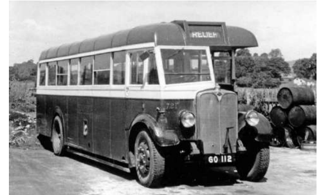
ex-Blue Belle GO 112 (721) rebodied by Duple in 1942. (Alan B Cross)