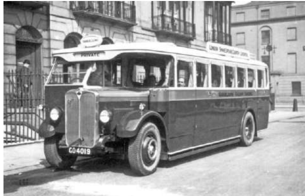
Samuelsons A.E.C. Regal GO 4019 (later Red & White 9) with Scammell & Nephew C30D bodywork before sale to Red & White in 1932.