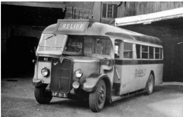
Ralph's Garages Regal GF 513 (later Red & White 622) with rebodied 1942/3 Burlingham coachwork. GF 513 started life as Green Line T130 (Alan B Cross)