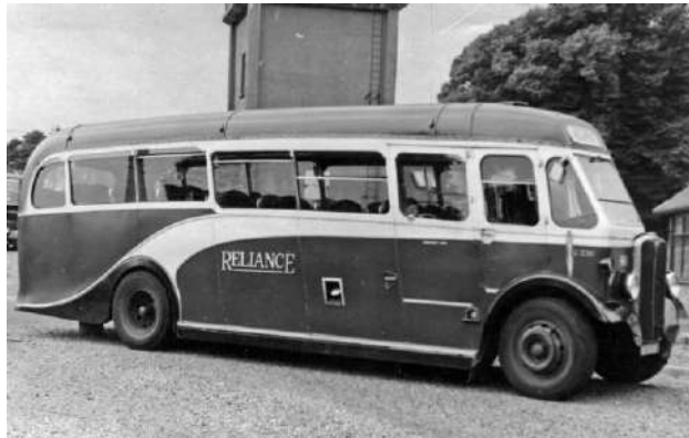
1930 Regal GH 8093 was rebodied in 1939 with Duple C32F coachwork, here shown in Reliance livery with Red & White 1951 fleet number C230.