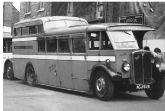
Blue Belle Regal AGJ 928 with London Lorries observation coachwork taken before Red & White ownership