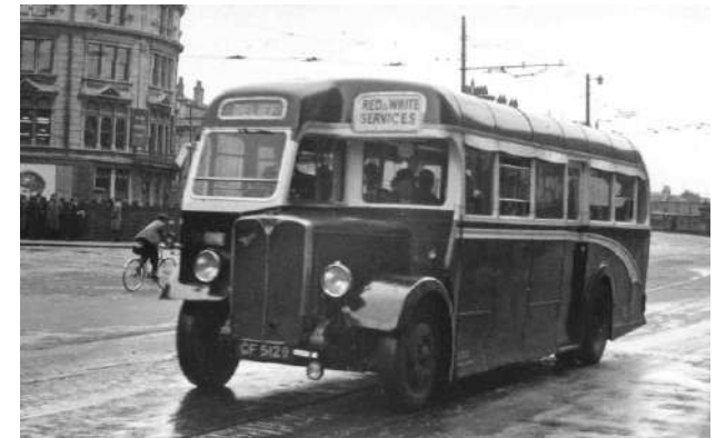
Another ex-Blue Belle Regal GF 5129 (109) with rebodied 1941 Duple B35C coachwork.