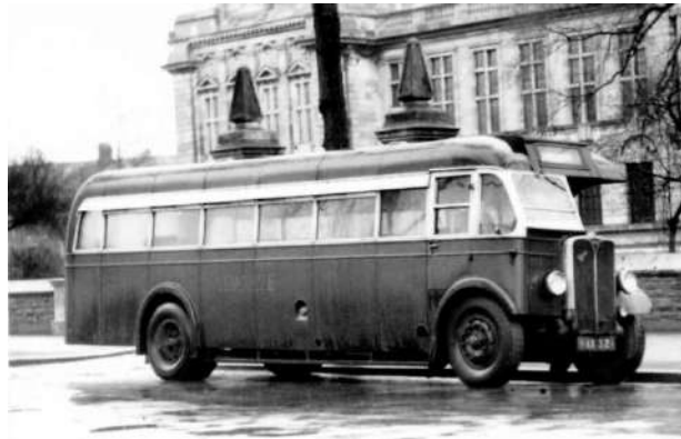
A.E.C. Regal O662 FAX 321 (S131). Originally Green Line Coaches GH 8090 with Hall Lewis C27R body, it passed to L.P.T.B and eventually to the Ministry of War Transport. It was fitted with a new Burlingham body and Gardner 5LW oil engine before entry into service with Red & White in 1944.