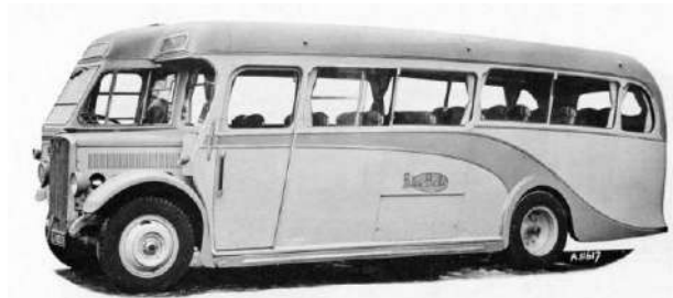
Blue Belle 1930 Regal GJ 8071 (later Red & White 716) in two tone blue livery as rebodied in 1939 with Duple C32F coachwork. (Duple Coachbuilders Ltd)