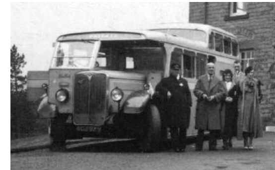
Blue Belle observation coach AGJ 929 photographed in 1933 at Bettws-y-Coed. (Glyn Bowen)