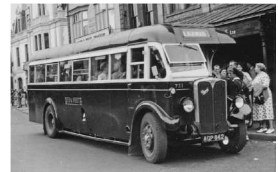
ex-Blue Belle Regal AGP 842 (731) with rebodied 1944 Burlingham B34F coachwork outside the Red & White office in Pontypool. (Alan B Cross)