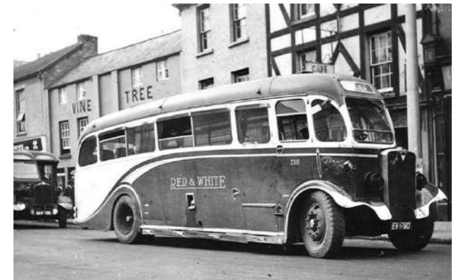
A wartime photo in Monmouth of ex-Gorseinon & District 1939 Duple-rebodied Regal EV 1780 (215) with white painted mudguards and shielded headlights.