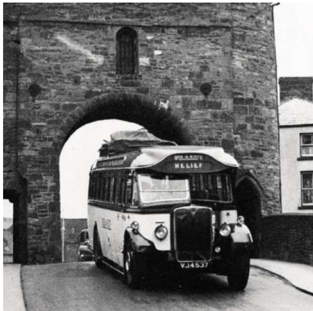
ex-Nell Gwynne Regal VJ 4537 (218) with original Harrington coachwork taken in the early 1930s in Monmouth.