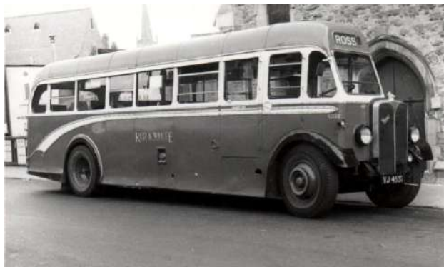
ex-Nell Gwynne 1932 Regal VJ 4537 (S332) rebodied with bus bodywork by Duple in 1942.