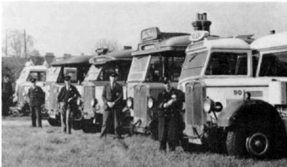
Nearest the camera is the unusual ex-South Wales Express Arlington/Meltz-bodied Regal PJ 3828 (90) with separate drivers cab and V-fronted passenger cabin. Immediately behind is Blue Belle Regal GO 119 (later 724).

Fleet Nos. in red are reallocated numbers from withdrawn vehicles. Ex-Blue Belle vehicles initially kept their original Blue Belle fleet numbers. Those coaches remaining were renumbered with a prefix B by 1/1939. In 3/1941 the London operations ceased and the coaches were transferred to the Red & White fleet. In 7/1942 those remaining were again renumbered by prefixing the Blue Belle number with 7.