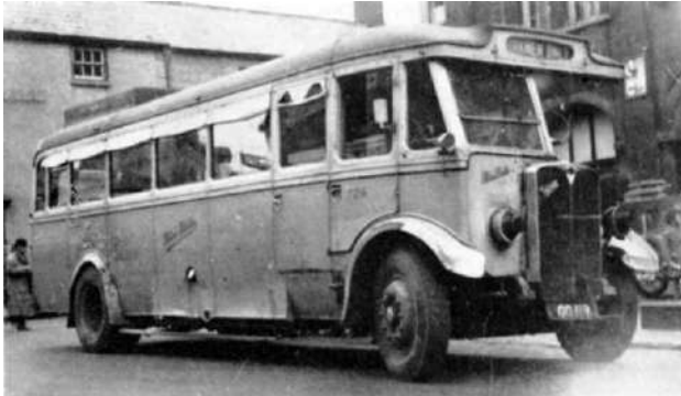
ex-Blue Belle GO 119 (B24) with original London Lorries C32R bodywork in Agincourt Square, Monmouth.