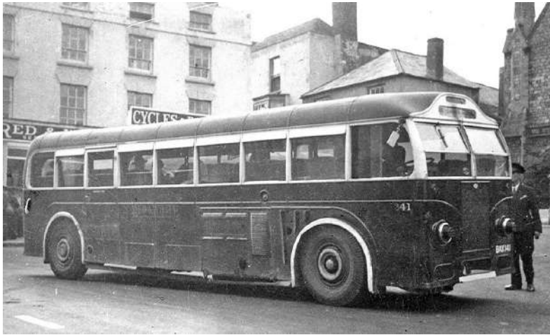
A wartime photo of BAX 141 (341) with Berw bodywork in Albion Square, Chepstow with white painted mudguards and shielded headlights.