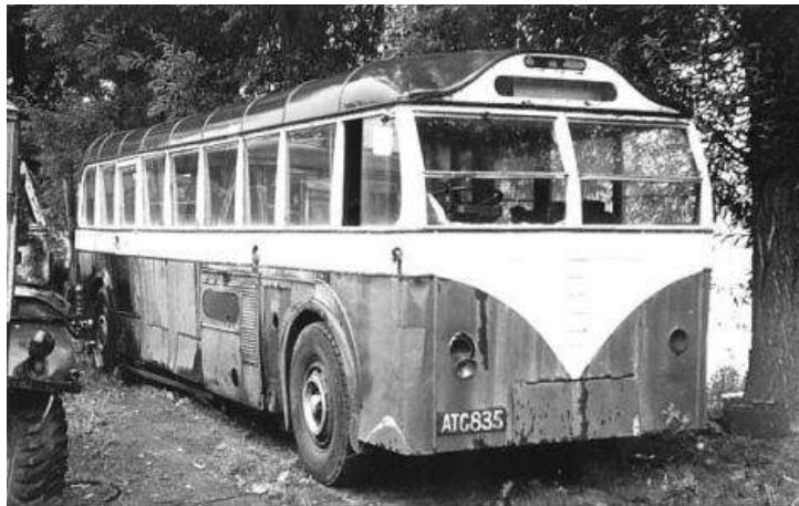
ex-Imperial Motors ATG 835 (356) with bodywork by John Norman & Co. of Cardiff, possibly after withdrawal.