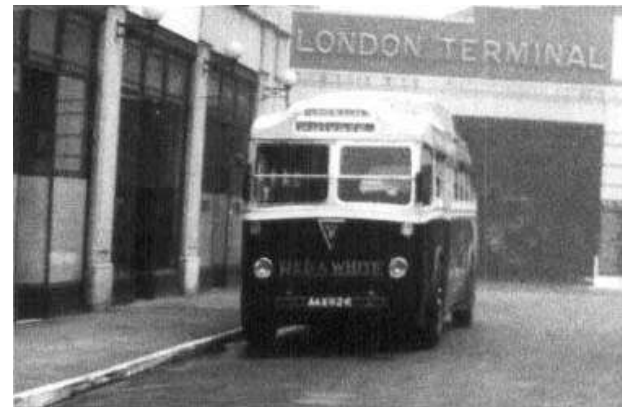
AAX 826 (280) with Northern Counties bodywork at the London Terminal Coach Station in Clapham Road.