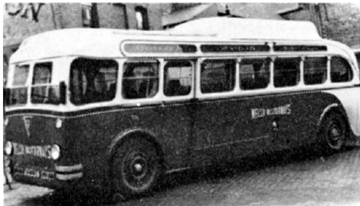
Gough's Welsh Motorways ATX 338 with Northern Counties bodywork, later Red White 279. (WJ Haynes)