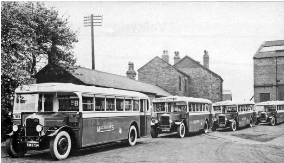
Roberts-bodied PW65s including EM 2734, EM 2736, EM 2737 and EM 2735 ready for delivery to MacShanes in 1932. (Roberts)