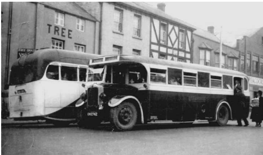
A wartime photo of Albion PW65 EM 2742 (250) in Monmouth.