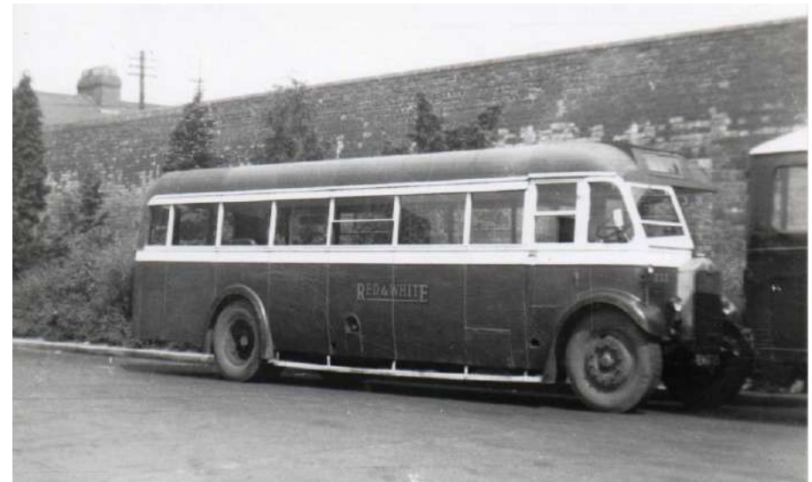
EM 2723 (233) rebodied with utility Burlingham B34F body.