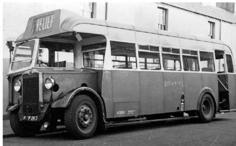
ex-Blue Belle EXF 263 rebodded by B.B.W. in 1950 as a B35R bus. The body was transferred to 1947 Albion CX13 FWO 649 ($1747) on withdrawal in 1957. See Section 1.23