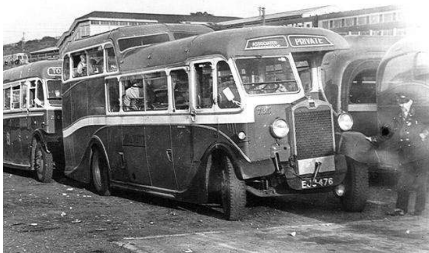
EJJ 476 (736) at Barry Island in Red & White livery before rebodding as a normal coach.