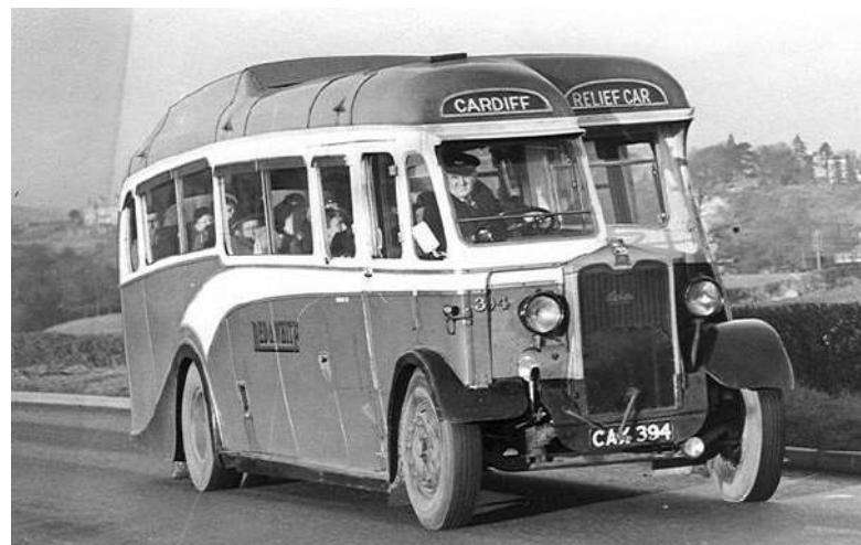
One of the 1938 batch CAX 394 (394) now provided with a curved and stepped waistline and windows with alternate slim pillars to give each pair of windows the illusion of a divided sheet of glass.